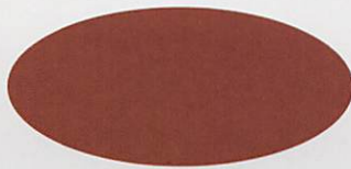
Brick Red #120

Today's vinyl windows and patio doors offer exterior colors never before available to homeowners. With some good organized planning and the help of your professional remodeler or designer you can achieve outstanding results. Using ColorTech™ by ViWinTech, you can choose from 11 exterior colors for the entire ViWinTech line of vinyl windows and patio doors.