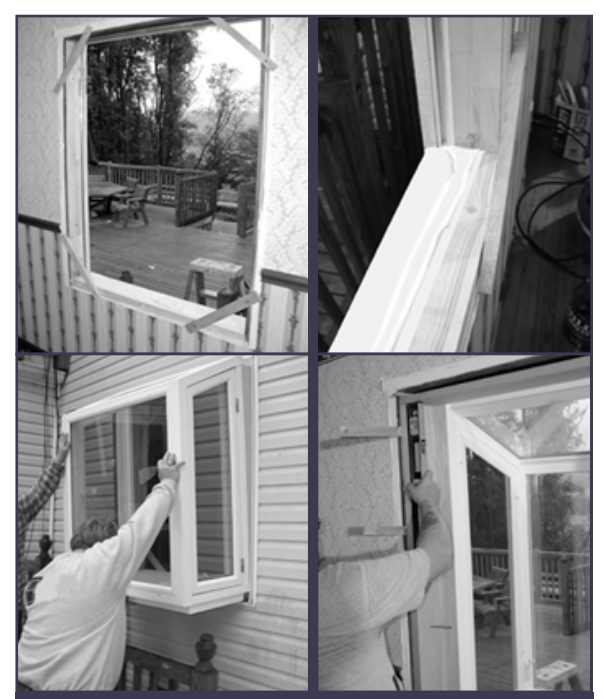
If using nails to secure frame in opening, using wood shims on each side of the nail will help protect the hardwood veneer from hammer marks.

Complete fastening frame by setting all nails with a nail punch. Fill the nail holes with wood putty. If using a color stick to fill holes, complete the process after the frame has been stained.